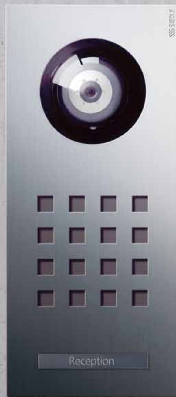
Siedle Steel door station with video camera, intercom system and call button; solid brushed stainless steel

Siedle Steel Siedle Vario Siedle Select Siedle Classic