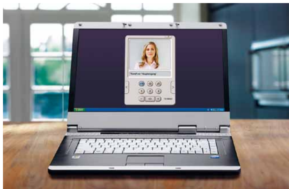
Siedle DoorCom-IP: connecting the door and the PC

Or just imagine: the door station is connected to your IP network. The call, speech and video signals from the door are fed into the network and picked up by a software client. The PC then takes over all of the tasks of an indoor station – including video presentation, door release, switching functions and status messages.