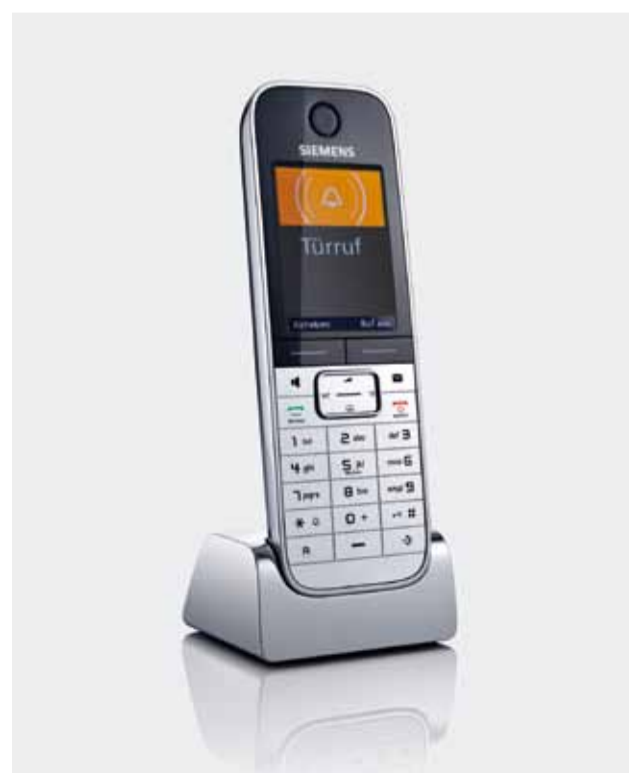
Siedle DoorCom: connecting the door and the telephone

More about this topic at www.siedle.com/telephone