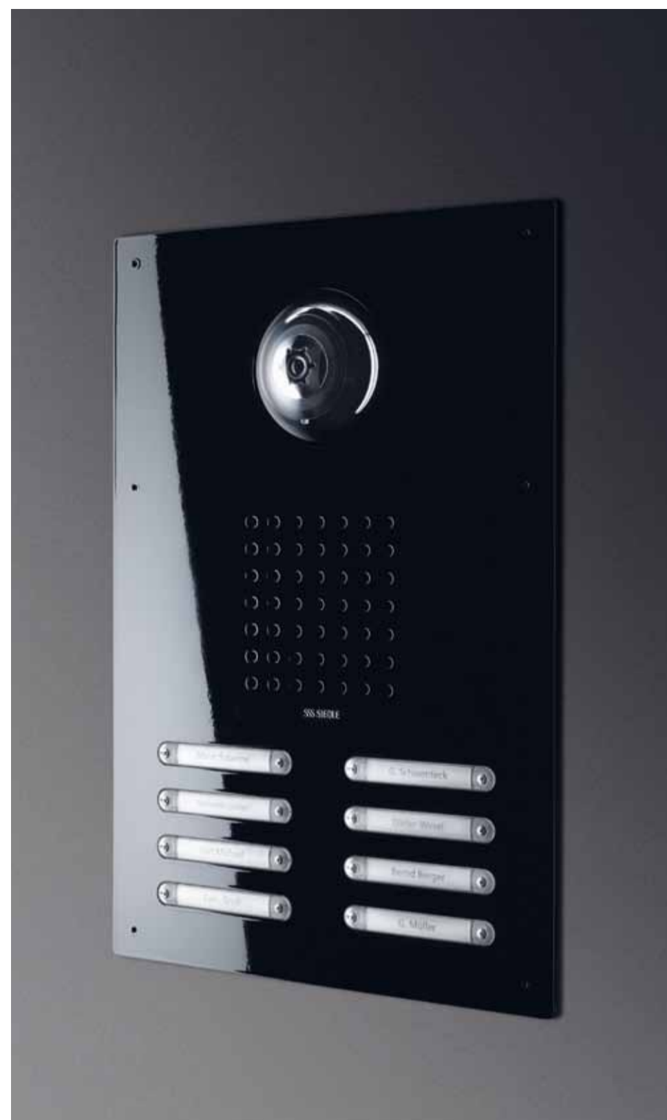
Video door station in high-gloss black paintwork finish.

Specially developed to replace TL 111 Series door stations: a variant of the current Siedle Classic product line.