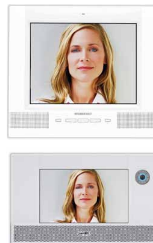
The connection to the lifestyle of the future: operating panels assume the functions of the indoor station for the communication system (pictured: displays from Crestron and AMX).

Siedle provides intelligently networked buildings with the appropriate building communication systems. A special interface permits the exchange of communication and control signals with the building's automation and entertainment systems from leading manufacturers. In the process, their visualization and operating displays function as the indoor station for the door and building commu-