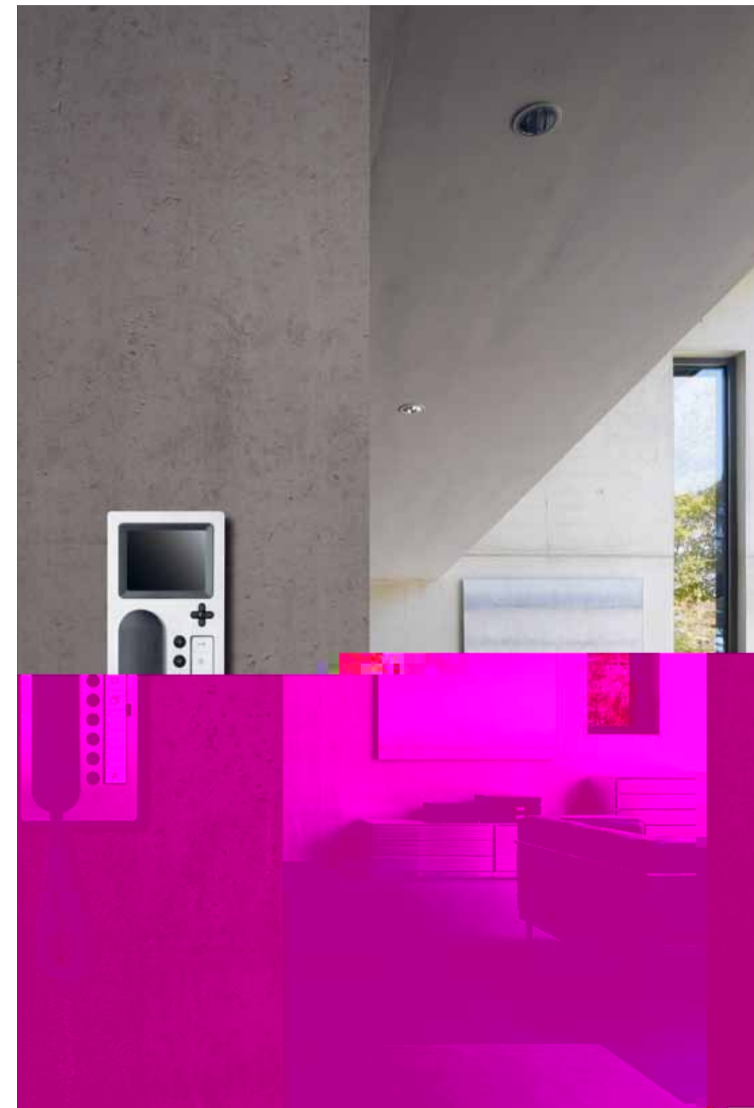
© Architecture: Frank-Architekten, Winnenden/Photography: Zoëy Braun/arturimages